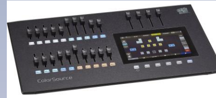
ETC ColorSource 20 Console